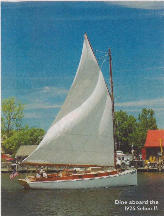
Dine aboard the 1926 Selina II .